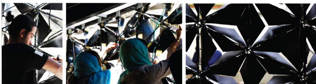
Applications are made of glass fiber

Kinetic Curved- reinforced plastic (GFRP) , most recently Line Folding called the Flectofold in conjunction with (CLF) element elastomer products.